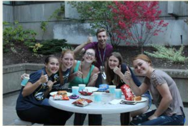
Hands-on education for real-world achievement.