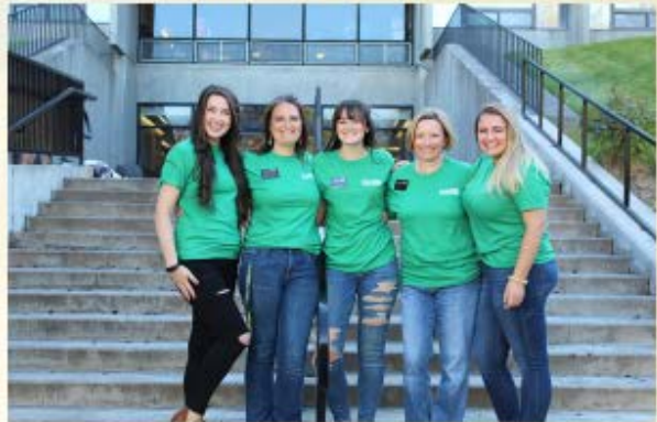
Housing Office Staff